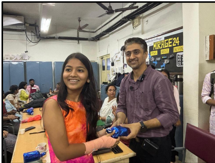
“A small gift to honor your huge impact”