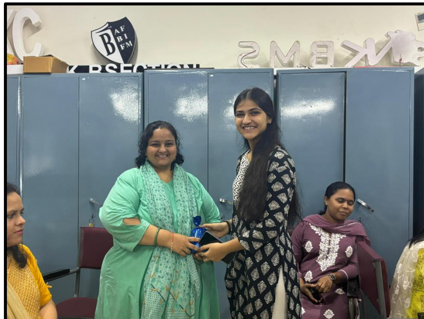
“Thank you for planting the seeds of knowledge that will grow forever”