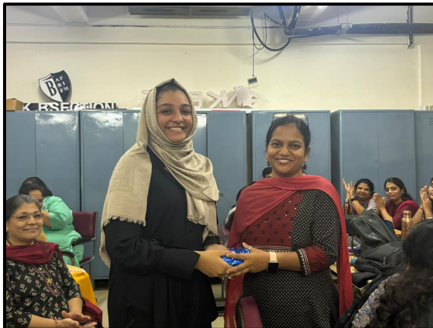
“A Guru is the Light that guides us through Darkness”