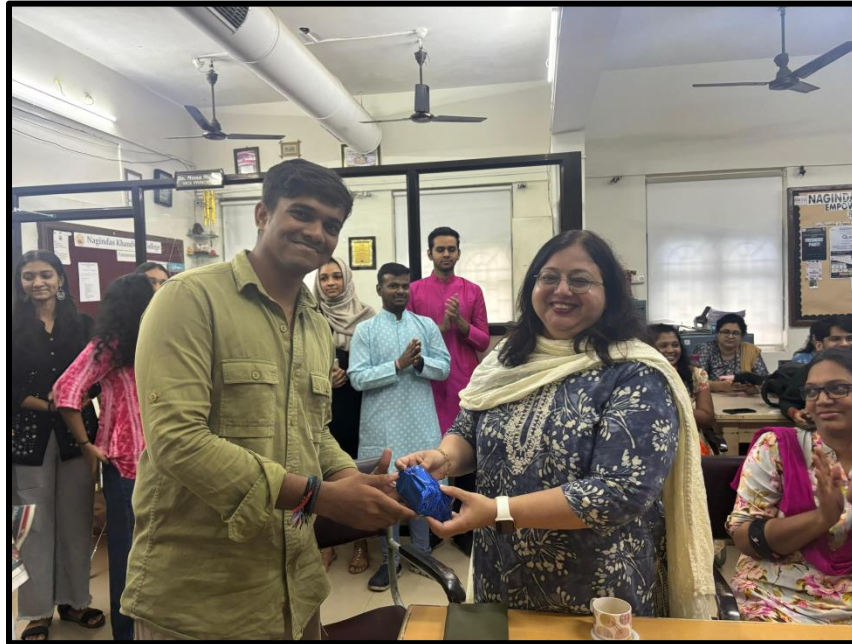
“Celebrating Guru Purnima with our teachers embracing joy and gratitude”