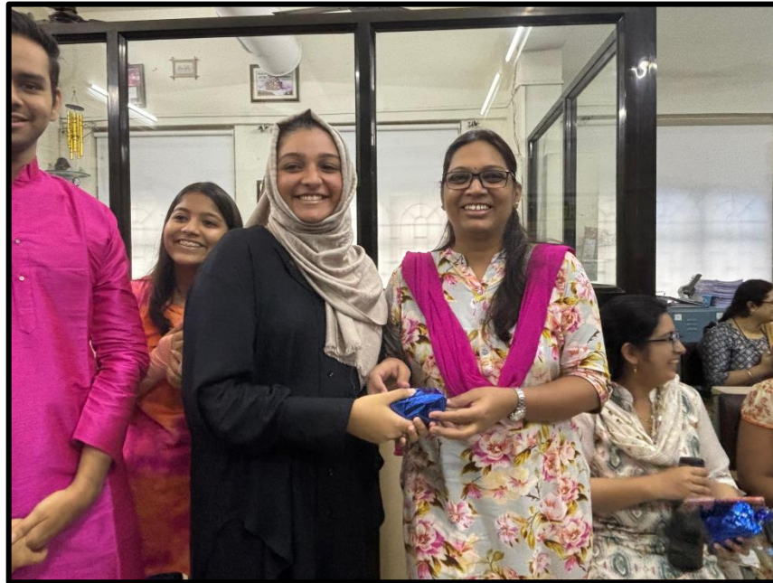
“A Guru’s presence in our lives is a gift that continually enriches our path”