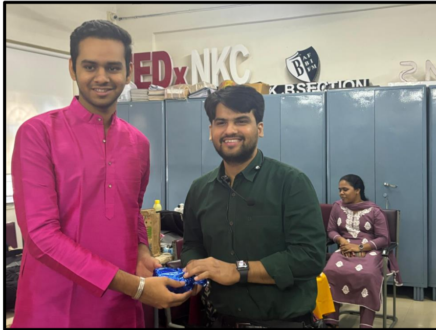
“Thanking the Teachers for their wisdom and inspiration”